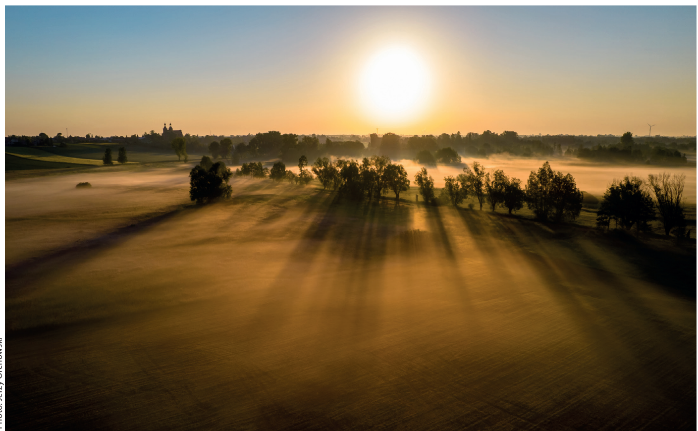
Awarded photo in the category "Wielkopolska village from a bird's eye view" by Jerzy Orchowski. The photo shows the Warta River Landscape Park, it was taken in the village of Ladek, Ladek commune, Stupca poviat

The previous editions of the competition were very popular. From year to year, the number of submitted works is growing, they are distinguished by originality, aesthetics and creativity, which makes the selection of the winners a difficult task for the members of the Jury. The winning works from the 1st and 2nd editions of the competition can be seen at www.wielkopolskie.ksow.pl. They show the beauty of rural areas through the eyes of the authors of the awarded photos.