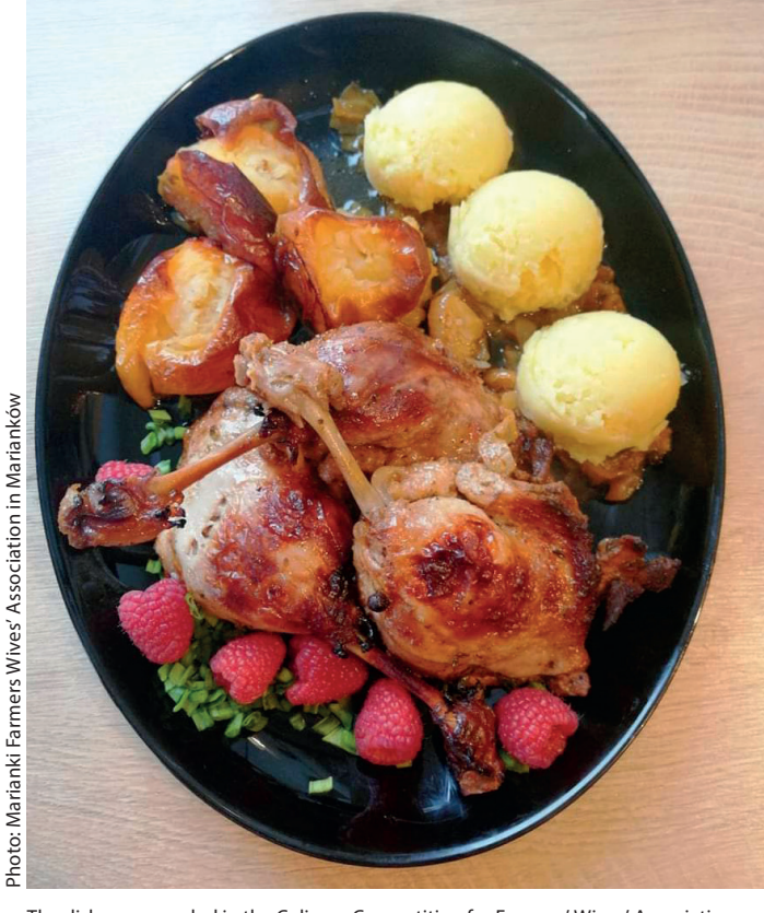
The dish was awarded in the Culinary Competition for Farmers' Wives' Associations entitled "Delicacies from Wielkopolska orchards" for the best regional dish with apple or plum - "Duck thigh in cider and apples with wedge roasts from Marianki" by the Marianki Farmers' Wives' Association in Marianków

Wash the duck's thighs and dry them with a paper towel. Rub each thigh with salt, pepper and red sweet pepper. Put aside. At this time, put two apples in a bowl, cut into quarters, with the skin, without seed nests. Throw in allspice and bay leaves, crushed garlic cloves and onion cut into feathers. Put on the thighs and pour over the cider. Put it in the fridge for 24 hours. After the time, remove from the brine, dry the thighs and rub with plenty of marjoram.