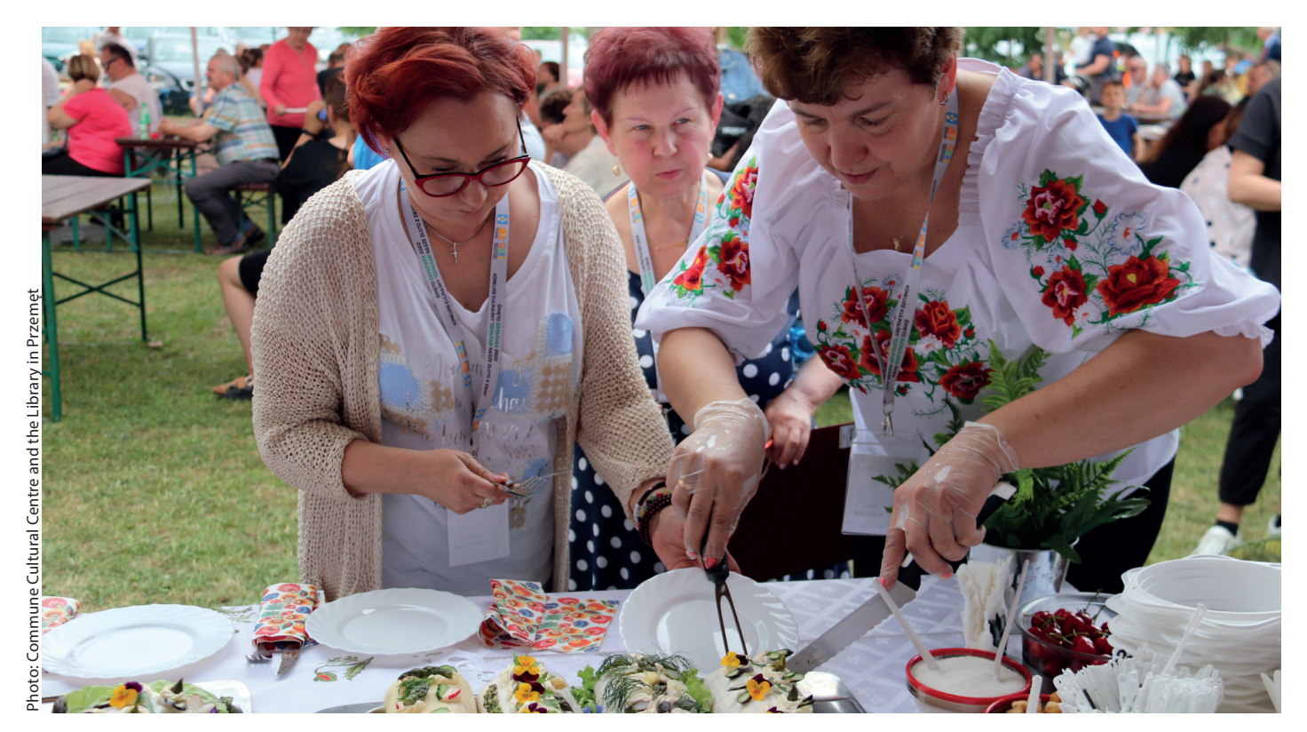
Culinary struggle of Farmers' Wives' Associations during the competition "Asparagus, our Gold from the Earth" organized by the Commune Cultural Centre and the Library in Przemet

Przemęt conducted the culinary competition "Asparagus, our Gold from the Earth". The action aimed at activating rural residents to take initiatives related to area development, including the creation of jobs in rural areas, was granted funding in the amount of PLN 36,000.