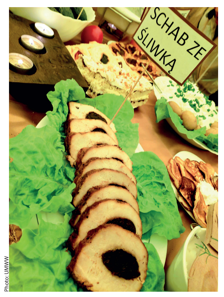
During the final of the competition, guests could taste the specialties prepared by farmers' wives' associations.

Farmers' wives' associations are voluntary, independent, self-governing, social organizations of rural residents supporting