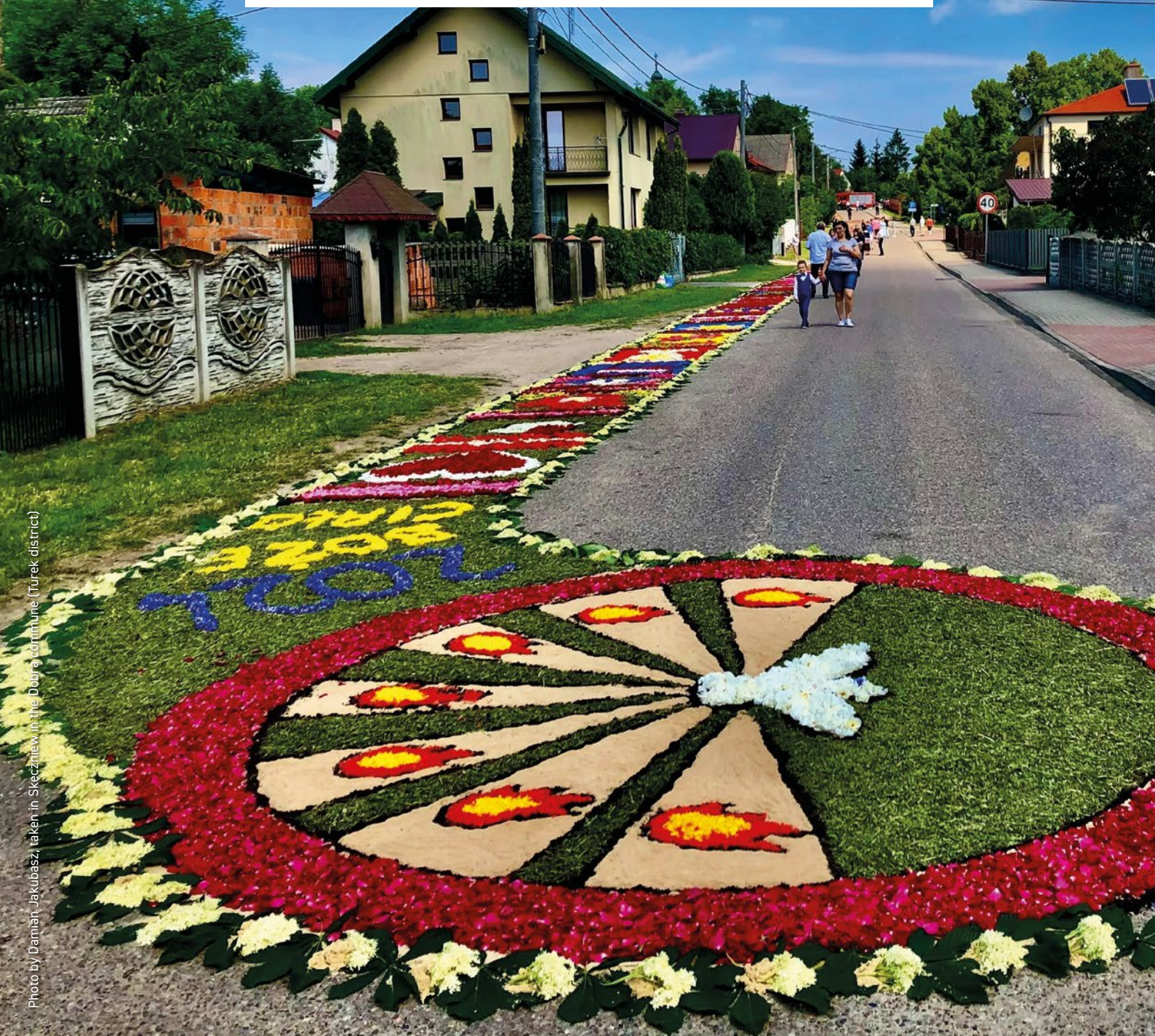
taken in Skęszew in the Dobra commune (Turek district)