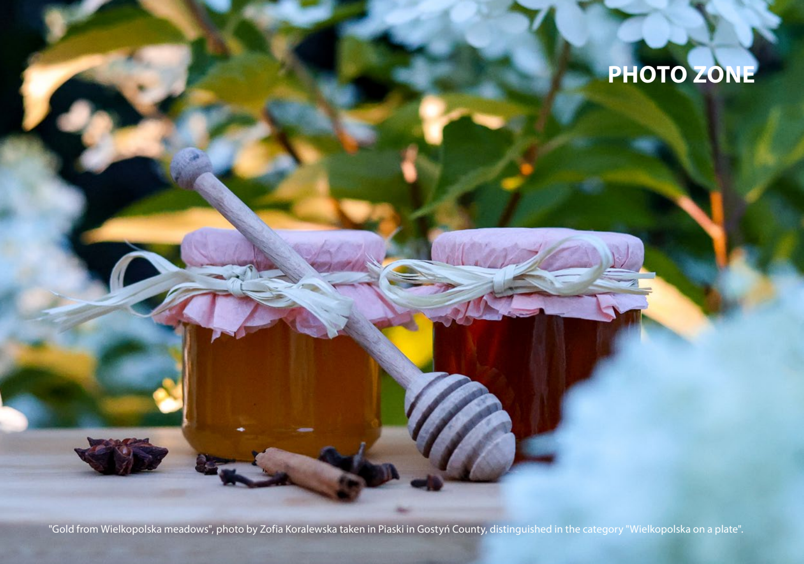
"Gold from Wielkopolska meadows", photo by Zofia Koralewska taken in Piaski in Gostyń County, distinguished in the category "Wielkopolska on a plate".