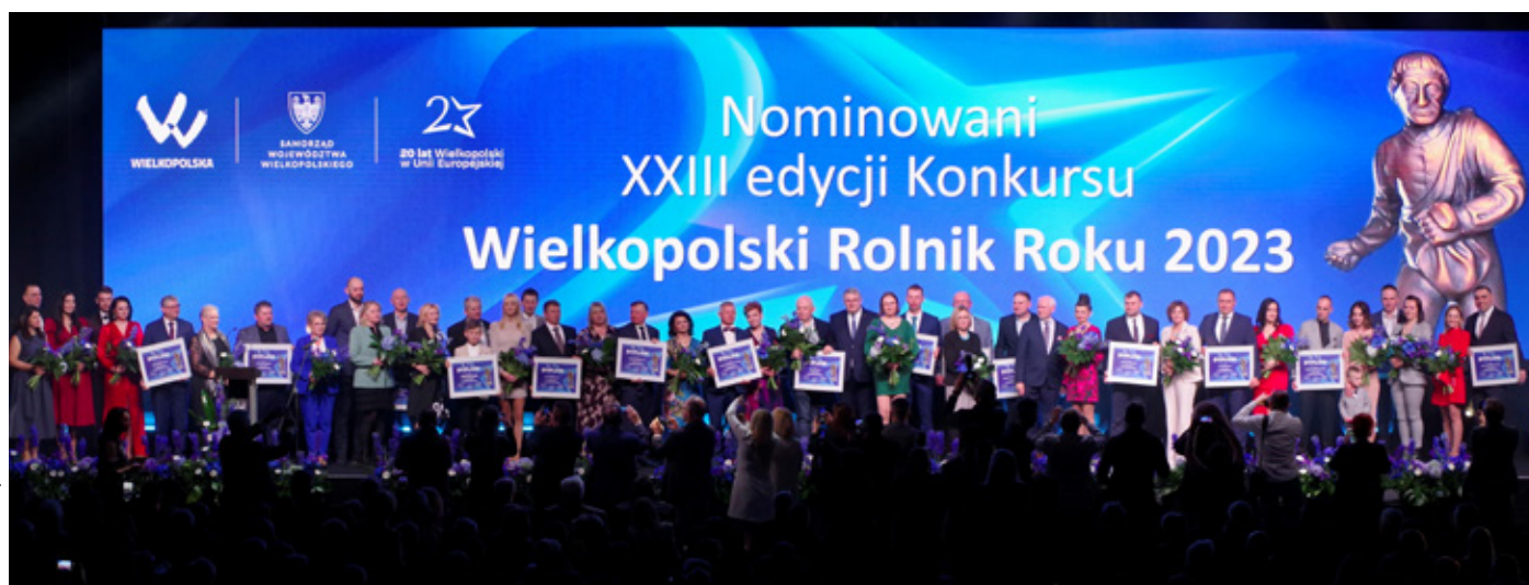
The competition jury has decided to nominate 21 farmers.

In accordance with a long-standing tradition, in March the Wielkopolska Regional Government organizes the final gala in the Earth Hall of the Poznan International Fair, which is a summary of the Wielkopolska Farmer of the Year competition. This year, too, the hall was filled to capacity. 63 farms were registered for the 23rd edition, of which the competition jury selected 21 nominees and 10 winners.