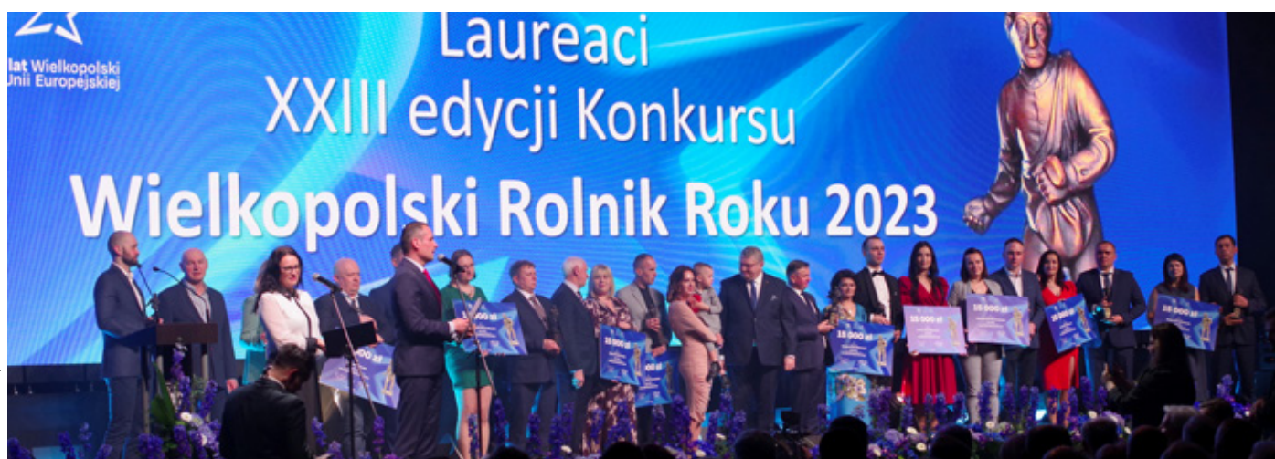
The ten of Wielkopolska Farmers of the Year 2023.