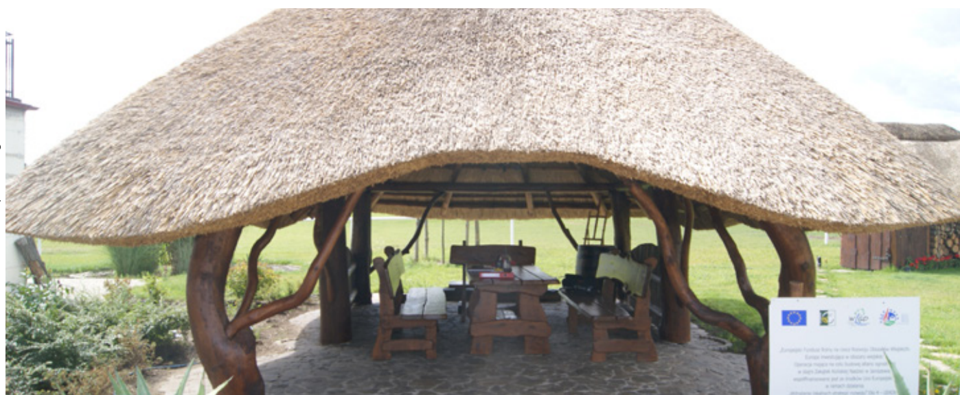
Garden gazebo in Janiszew in the Poniec commune in the Gostyń district.

Source: Marshal Office of the Wielkopolska Region, archive.