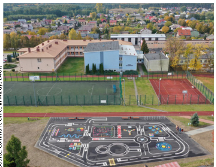
A traffic facility in Władysławów in the Turek Poviát.