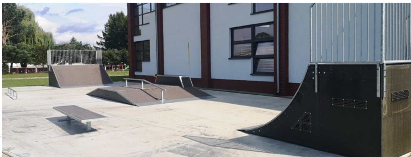
Skatepark in Rychtal.