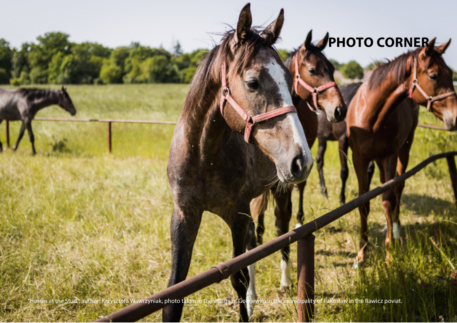
"Horses at the Stud"; author: Krzysztofa Wawrzyniak, photo taken in the village of Golejewko in the municipality of Pakoslaw in the Rawicz powiat.