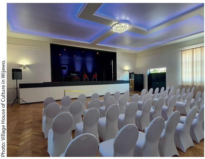
In Brenna, in the commune of Wijewo, co-financing from the Program enabled the reconstruction of the Village House of Culture

The rain garden is an interesting and inspiring place that supports the development of pro-environmental attitudes among the youngest inhabitants of the commune. The subject of the co-financed project was the development of a plot at Bukowa in Rabowice in terms of the development of innovative green infrastructure in shaping pro-ecological attitudes of the inhabitants of the Swarzedz Commune. The facility is located in the vicinity of the village club building and has been equipped with, among others, educational boards, a mud kitchen, a meteorological trail, a sensory path made