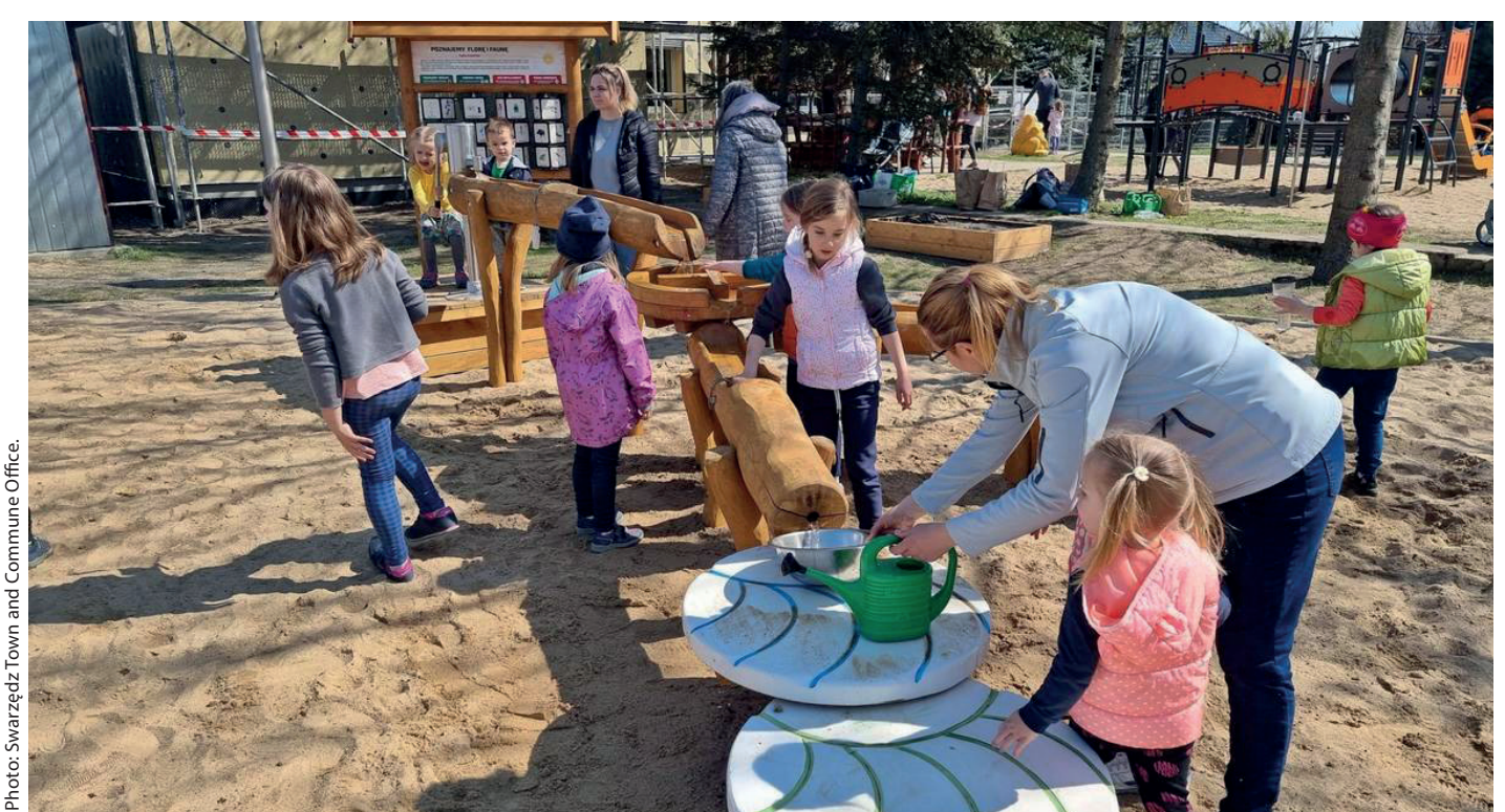
The playground in Rabowice is a place created not only for fun, but also with an educational function.

of natural materials and a relaxation set with a seat made of stumps and a wooden table. The revitalized area also serves as an educational, non-commercial public playground for children of all ages. The area of the square is about 200 m2, half of which is occupied by educational elements, and the remaining part is intended for a recreational area with a sensory path, a flower meadow and natural elements. Educational classes and workshops on topics related to the water cycle in nature and water retention will be organized in the newly created square.