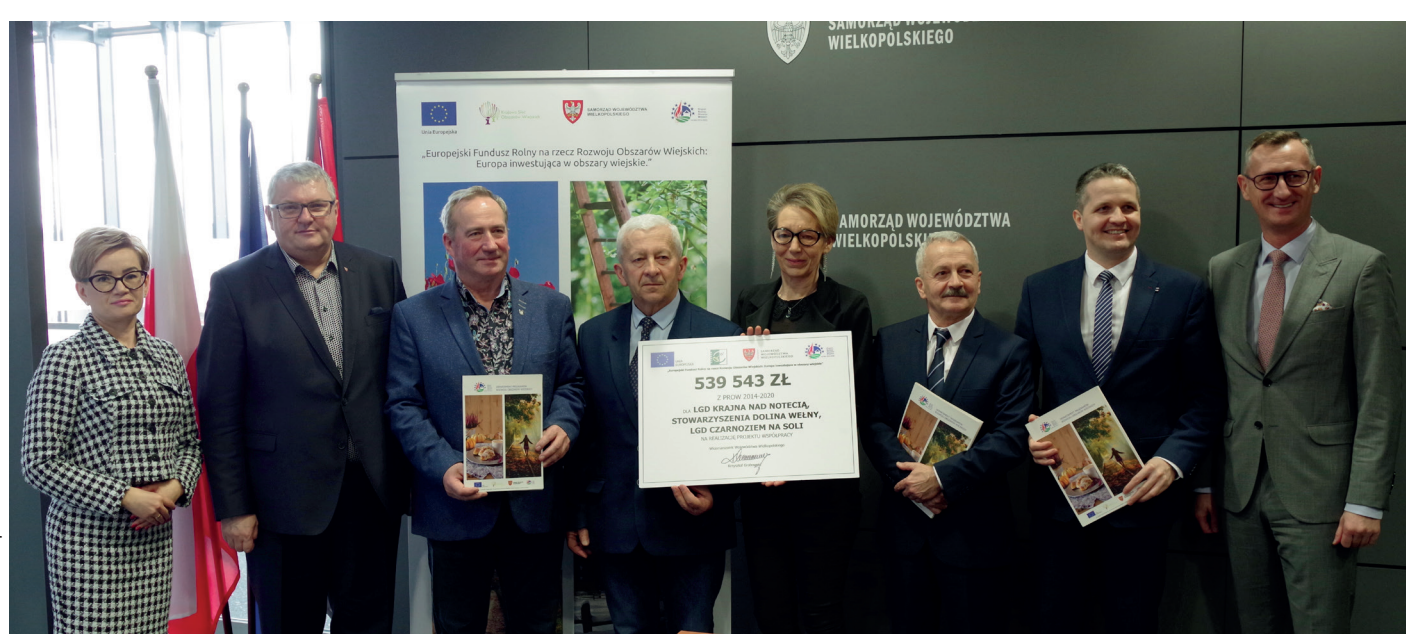
Two Wielkopolska and one Kujawsko-Pomorskie LAGs will jointly implement a pro-ecological cooperation project.

In January 2023, the project of this LAG entitled "Active Krajna thanks to the leaders" was settled. The action involved organizing a variety of activities for women activists who, by participating in the workshops, gained the opportunity to increase their self-esteem and mobilize them to act for the benefit of their local community. As part of the project, a soft skills test was held. Participants could discuss results individually. Image-building workshops, "How to deal with stress?" public speaking workshops, a meeting with an accountant, an educational meeting "Teamwork" and sensory and herbal classes were also organised. The project received funding from the Rural Development Program for 2014-2020 in the amount of PLN 49,500.