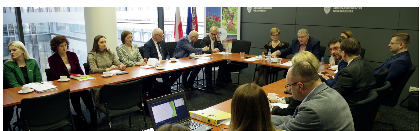
5th meeting of the Working Team for the implementation of the CLLD instrument in the Wielkopolska Region.

Local Action Groups apply not only for funds for the implementation of community-led local development strategies, but also for funds for managing the strategy and animating the local community. The developed strategies will be assessed by a committee consisting of representatives of the Wielkopolska Region Board and independent experts. We should know the result of the call by the end of 2023. As a result, framework agreements will be signed between the local government and local action groups. Thanks to them, new calls for proposals will be announced since 2024. Importantly, applying for funds will be done using dedicated IT software, which is intended to streamline the information exchange process.