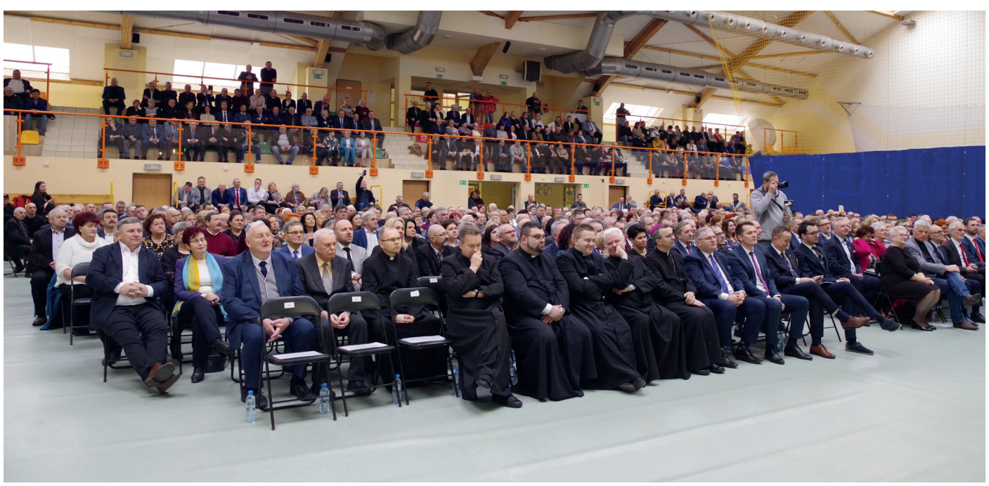
On March 11, 2023, a meeting of Wielkopolska village leaders was held in Stawiszyn, co-financed by the National Rural Network

Honourary awards were also presented to seven village councils. Commemorative statuettes went to: Wiktorówko village council in the Łobżenica commune, Jankowo Dolne village council in the Gniezno commune, Olszówka village council in the Olszówka commune, Solec village council in the Przemęt commune, Jaroszewice Rychwalskie village council in the Rychwał commune, Smardze village council in the Trzcinica commune and Kołątajew village council in the Ostrów Wielkopolski commune.