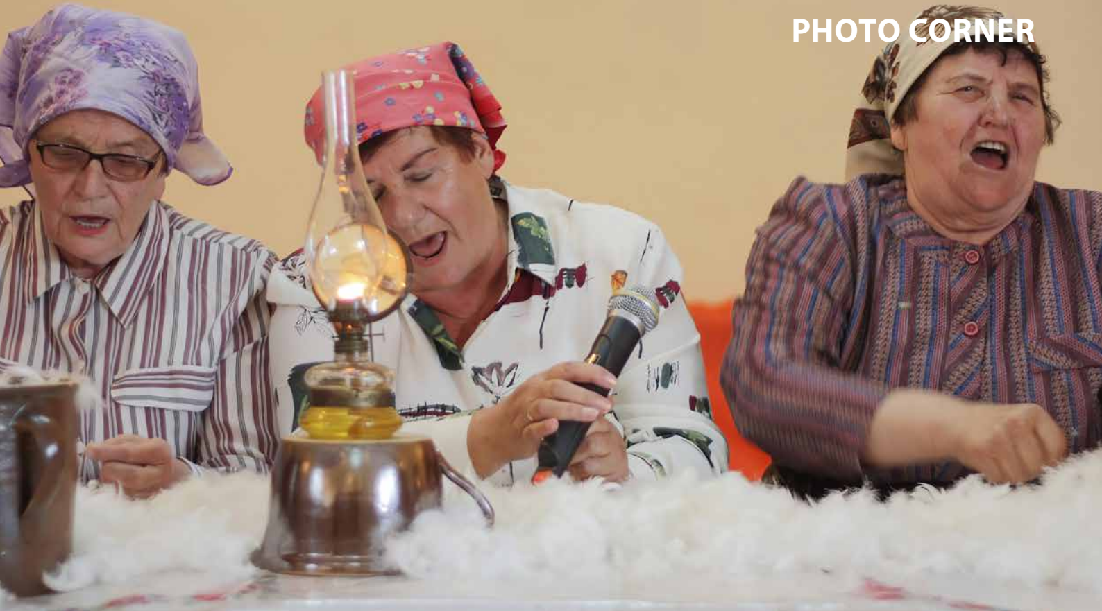
"Review of Farmers' Wives' Association Folk Ensembles in Nowa Wieś/Farmers' Wives' Association from Kobierno showing how to tear featers", photo taken in Nowa Wieś in the municipality of Rozdrażew (Krotoszyn powiat)