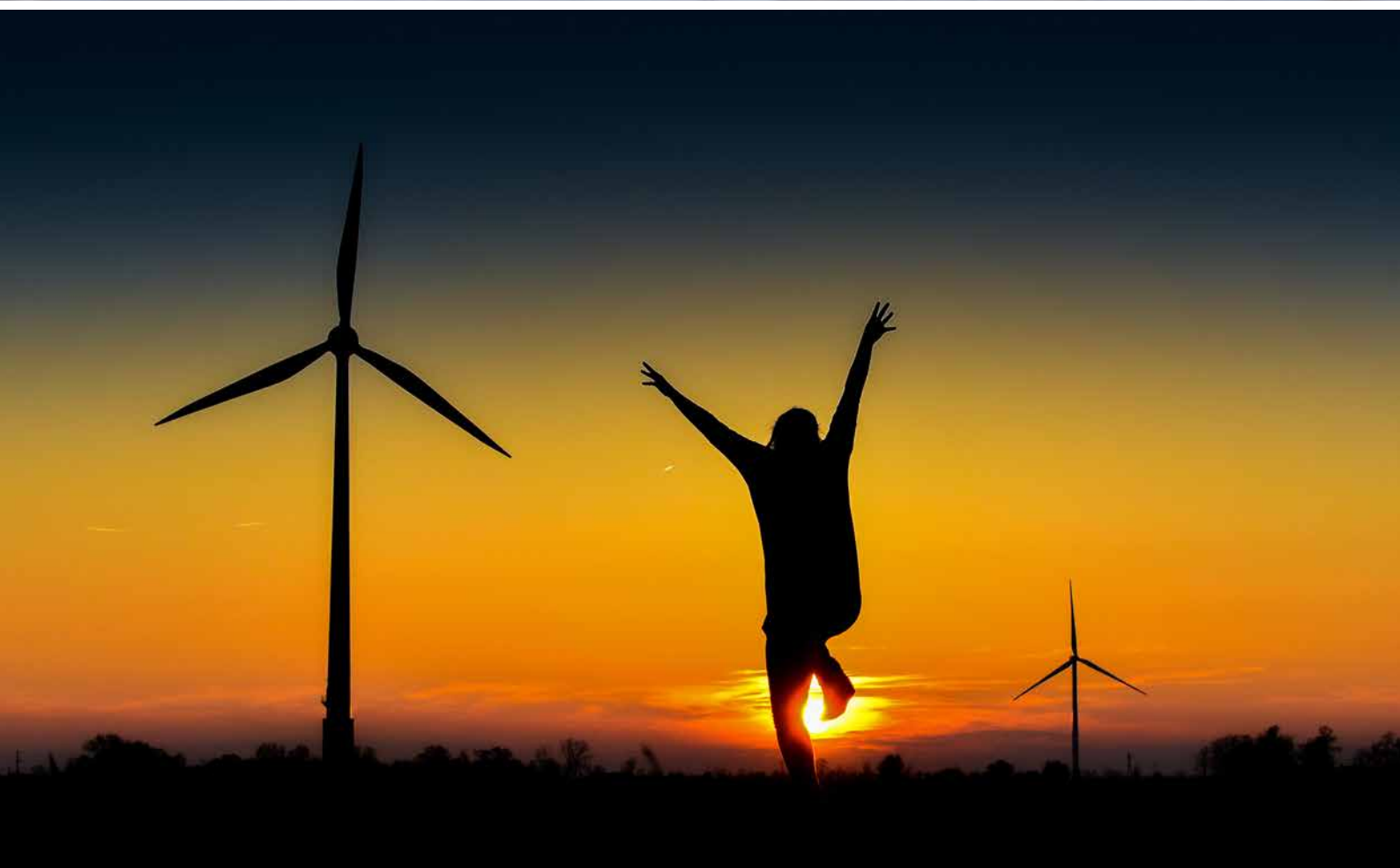
photo taken in Wola Koszucka Parcele in the Słupca commune (Słupca powiat).