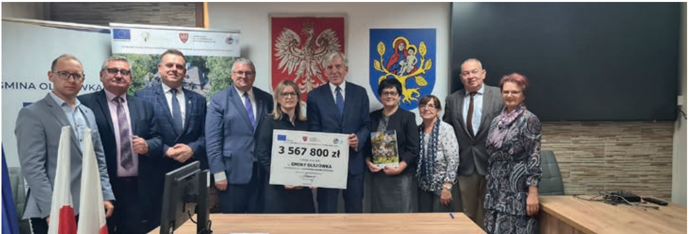
The Olszówka commune is one of the beneficiaries of the Rural Development Program 2014-2020, they invest in water and sewage management.

includes the reconstruction of the water supply network and the construction of a sanitary sewage system in Łagiewniki, as well as the purchase of a UV lamp for water disinfection for the water treatment plant in Długołęka.