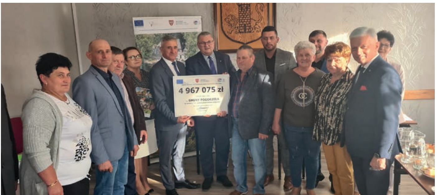
The list of co-financed projects related to water and sewage management includes the Pogorzela commune in the Gostyń Powiat.