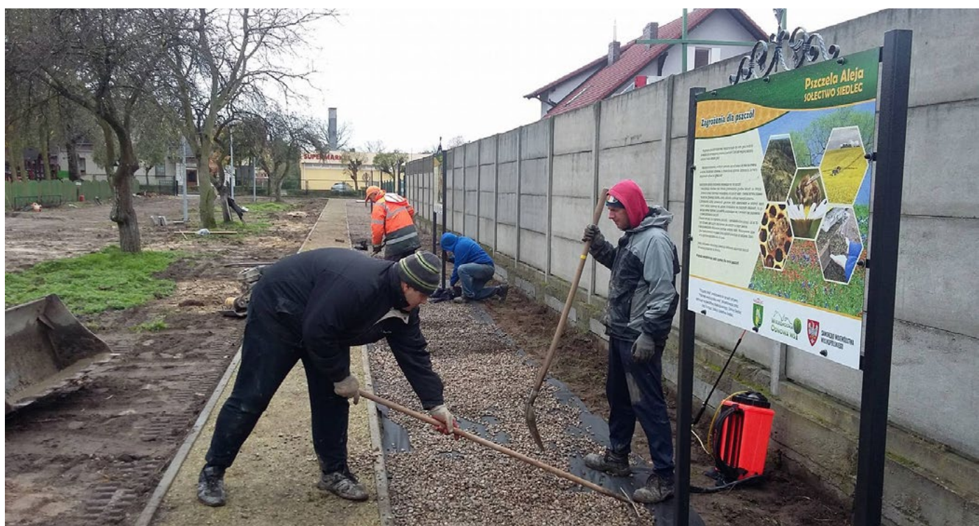
Implementation of the project referred to as “Construction of an educational path “Bee Alley” in Siedlec village administration which was distinguished with an award of the Self-government of the Wielkopolska Region during this year’s final gala of the all-Polish competition “Village administration fund - the best initiative”.