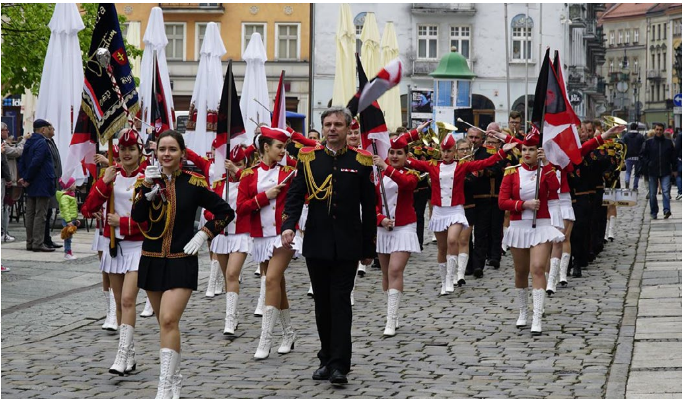
The Regional Review of Voluntary Fire Brigade Brass Bands in Kalisz in 2017. The photograph shows the Rychwał Voluntary Fire Brigade Band - a winner of the last edition of the event.