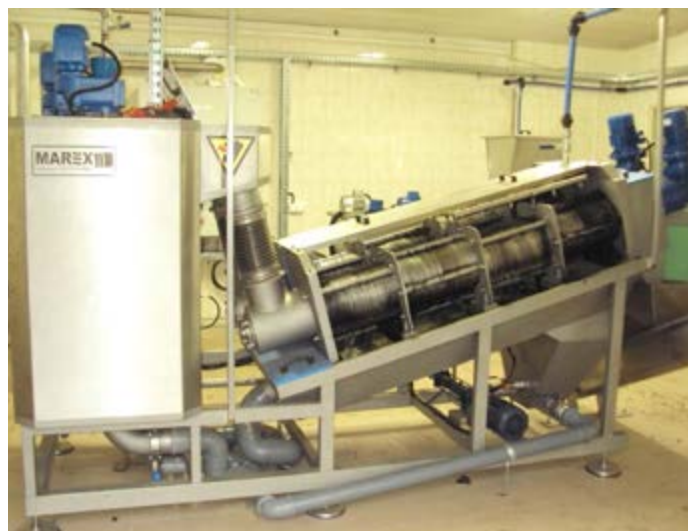
A modern press for sewage treatment plant in Lisków worth PLN 541,200 was purchased for funds obtained under the RDP for 2014-2020.

As for water and sewage management, with PLN 2 million grant from the RDP for 2014-2020, we fit out new construction areas, upgrade infrastructure by modernizing sewage and water treatment plants. The results cannot be overestimated, but in addition to tangible benefits, the RDP grants motivate local authorities to take actions improving the living conditions for our municipality residents. The competition form co-creates goals, allowing us to invest in the future of our residents.