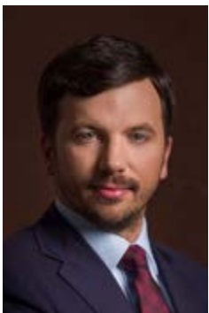
Mayor of the Town and Municipality of Grabów on the Prosna River Maksymilian Ptak