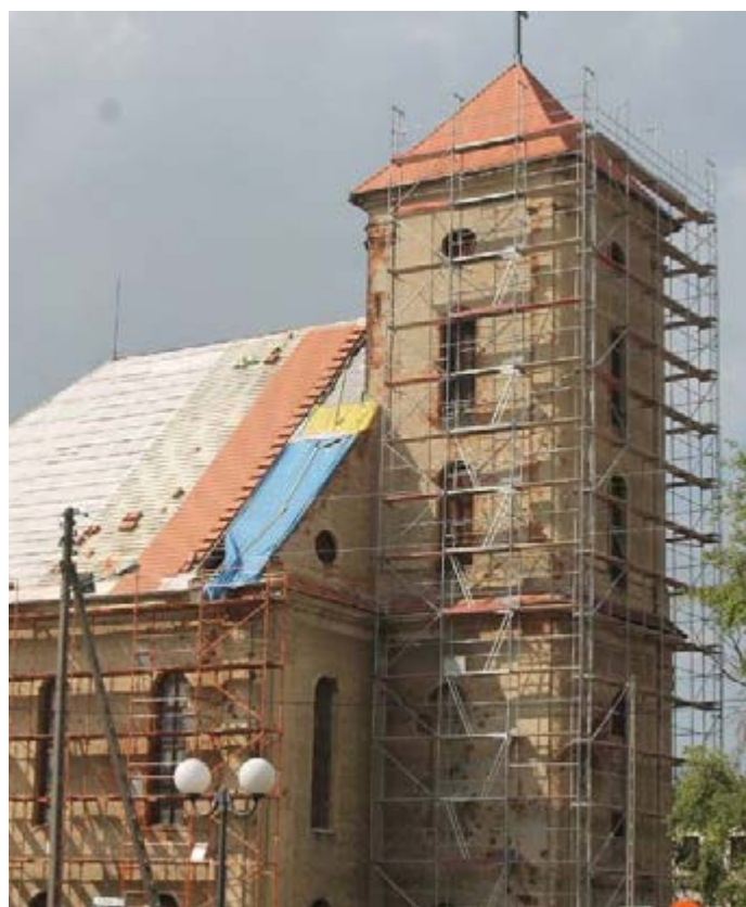
Photo: the Town Hall in Zduny

Financial support for renovation of monuments is also possible through local action groups operating in the Wielkopolska Region. LEADER, a community led approach