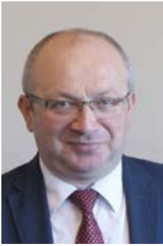
Mayor of the Rzgów Municipality Grzegorz Matuszak

The Rural Development Programme for 2014-2020 was generous for the residents of the Rzgów municipality. Nearly 6 km of roads were built, another strategic road will be completed in 2021.