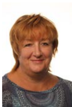
Mayor of the Lisków Municipality

other, develop their artistic and sports passions and relax. Municipalities must meet the resident's expectations and address their needs to the fullest extent. Residents, on the other hand, are not passive and take part in many projects implemented by local government.