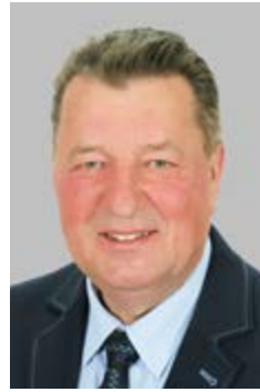
Mayor of the Town and Municipality of Szamocin Eugeniusz Kucner

Under the Rural Development Programme, 3 km of sanitary sewage system and over 2 km of water supply system were also built. In the Rzgów municipality, the RDP for 2014-2020 funds have been allocated both to infrastructure and also to culture. The rooms of the municipality Public Library in Rzgów were renovated. A new hall was built where various events are held to activate both young people and adults. Decent housing conditions will allow the municipality to organize meetings with authors, classes of the University of the Third Age and many other events.