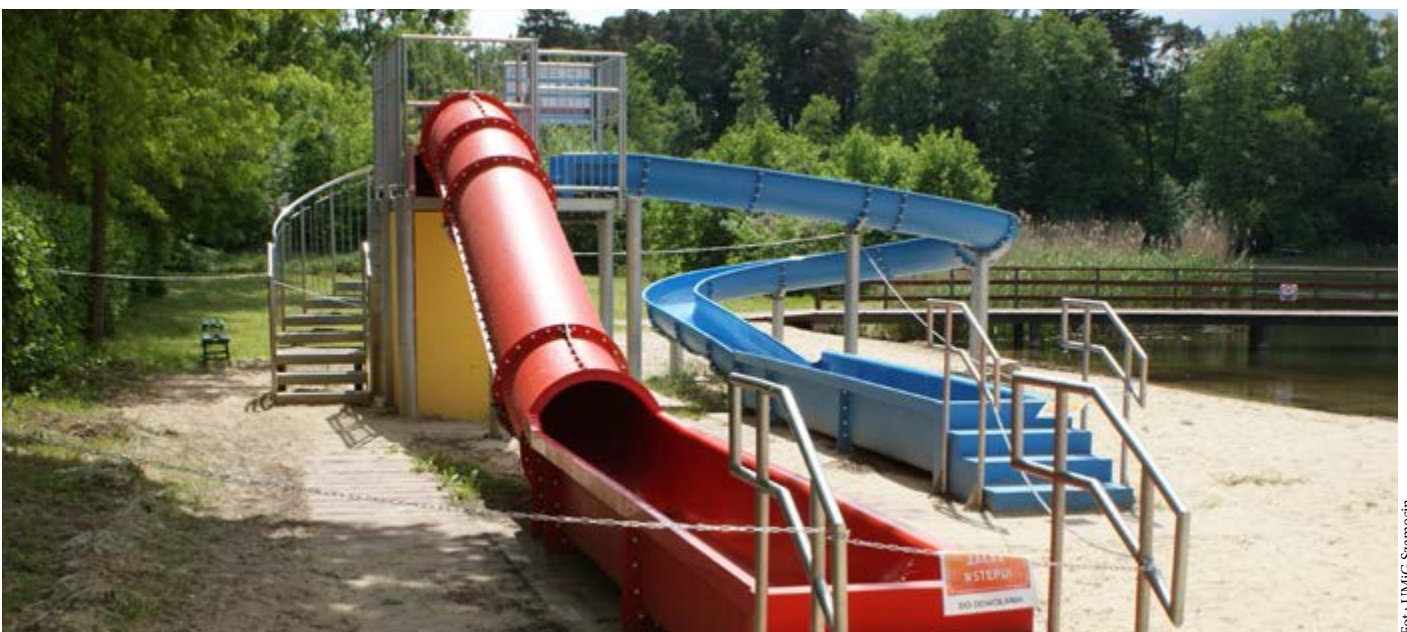
On the beach in the City Park in Szamocin two water slides were built. They are the main tourist attraction of this place the entire summer. The grant awarded under the RDP for 2014-2020 amounts to PLN 116,000.

As for water and sewage management improvement, we built a sanitary collector in the town of Atanazyń with a total length of 5,697.8 m and two sewage pumping stations. New recreation and sports grounds came into existence, such as a natural grass football pitch in Lipia Góra, measuring 90 m x 48 m, outdoor gyms in Szamocin at ul. Górna and ul. 19 Stycznia, in the villages of Nadolnik and Lipa. Water slides were built in the city park by the "Siekiera" lake in Szamocin. We also obtained funds for road infrastructure, with which we built new asphalt roads at ul. Kościelna, ul. 19 Stycznia and ul. Powstańców Wielkopolskich with a total length of 1,485.50 m. There are still many tasks to be performed as the needs are enormous. This is why we look into the future with confidence, hoping to obtain European funds, especially from the RDP.