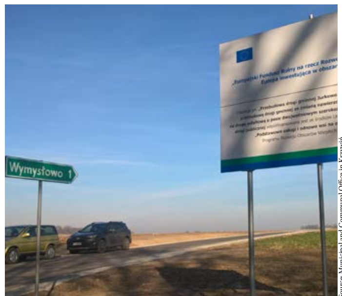
The rebuilt road in the Jurkowo-Wymysłowo section in the Krzywiń municipality. The grant from 2014-2020 RDP awarded to execute this project amounted to nearly PLN 1.8 million.

Thanks to EU funds from the RDP for the years 2014-2020, the impossible was accomplished... Few years ago, children from the Wymysłowo hamlet near the Jurkowo village could not get to the bus stop dry-shod. In 2016, when the municipality received the grant amounting to almost PLN 1.8 million for the construction of this road, our hopes rose to finally come true at the turn of 2018 and 2019. The project called "Reconstruction of the Jurkowo-Wymysłowo municipal road" make it possible to reconstruct the municipal road, change its pavement from cobbled stones to asphalt and made it a public road.