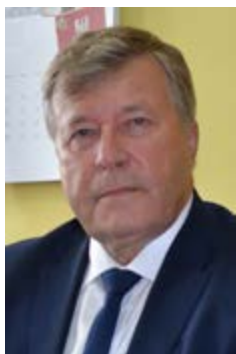
Mayor of the Kiszkowo Municipality

Another grant under this programme – over PLN 120,000 – obtained from the Krajna on the Noteć River LAG pool was spent on the construction and reconstruction of playgrounds in Krostków and Białośliwie, and the construction of a recreational facility in Pobórka Mała. In our municipality, entrepreneurs, associations, and the Farmers' Wives Associations benefit from EU funds. The RDP changes our villages, makes them beautiful, provides them with new infrastructure and allows them to increase the comfort of existing one. But above all, it changes us for the better by teaching us to be courageous in applying for EU grants. The programme allows us to make our dreams about what we need here and now come true. We have been waiting for years for this to happen.