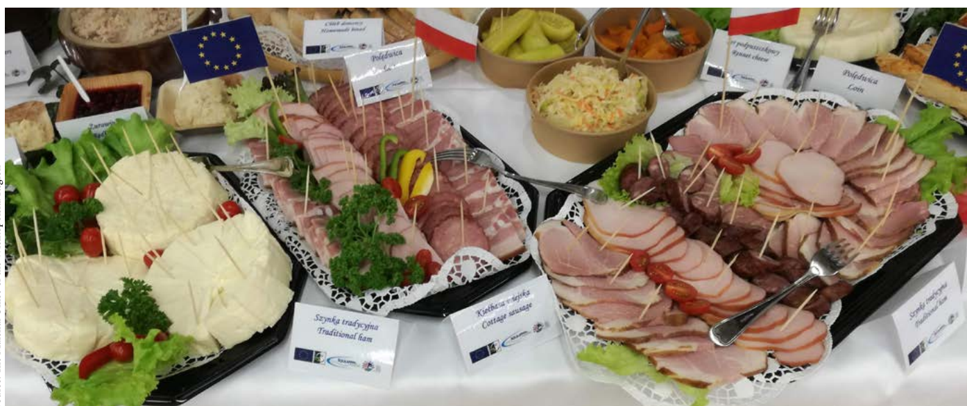
Among the delicacies presented by the LAG representatives were, among others, traditional cold cuts, cheeses, tinctures, beers, and other specialties of Wielkopolska cuisine.

nal cold cuts, cheese, tinctures, beer, and other specialties of Wielkopolska cuisine.