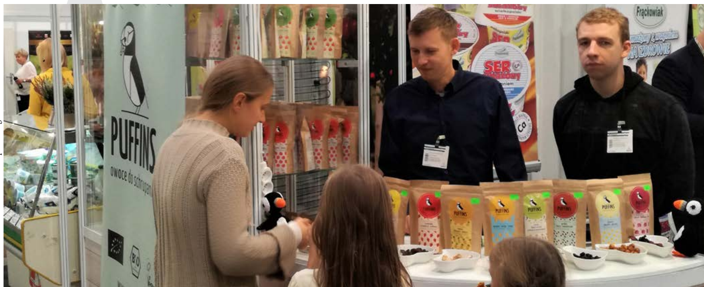
At the stand prepared by Wielkopolska Region, visitors could taste delicious cheeses, crunchy dried fruit, natural cold cuts and bakery products, as well as homemade pickles.