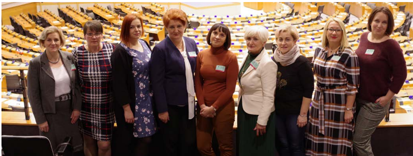
One of the points of the visit of the delegation from Wielkopolska Region was visiting the seat of the European Parliament.

The stay in the capital of the European Union allowed Wielkopolska residents to get to know the seat of the EU authorities. The programme included the meeting with Ewa Kopacz – Member of the European Parliament. The summary of the visit to Belgium was a study trip to the Schaapskooi sheep farm in Kasterlee. A project under the LEADER approach covered by the Rural Development Programme for 2014-2020 is being implemented therein. The representatives of the "Solna Dolina" had the opportunity to establish contacts with the Belgian LAG, as well as interchange knowledge and experience related to community-led local development in both countries. The organisation of the trip to Belgium was feasible thanks to the co-financing from the European Union under the National Rural Network Operational Plan.