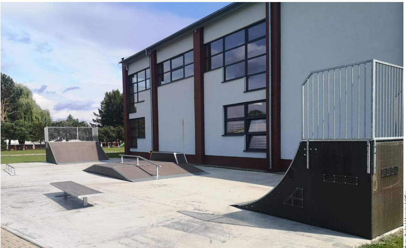
The skatepark in Rychtal in the Kępno district was built thanks to EU funds under RDP 2014-2020.

Anyone interested in accommodation in agritourism facilities located in rural areas of the Wielkopolska Region should visit the new website: www.turystyka-wlkp.pl . It contains information on agritourism farms and resorts awarded in all previous years of the competition for the best tourist facility in rural areas in Wielkopolska, organised by the Self-Government of the Wielkopolska Region. In this way, you can plan e.g. canoeing on one of the rivers flowing through our region or a stay in forest complexes full of mushrooms - the Noteć Forest and Drawsko Forest. It is also worthwhile to go fishing in the fishponds, bathe in the crystal-clear Powidzkie Lake or opt for a little horseback holiday. Those looking for creativity will find farms with ceramic workshops, and parents of young children may choose facilities where their toddlers can meet farm animals. For culinary enthusiasts we recommend the rich offering of restaurants associated in the Culinary Heritage Network of Wielkopolska.